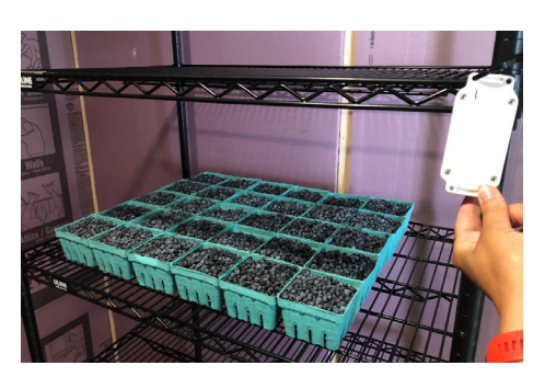
View past projects